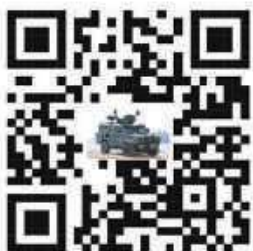
Rhino Guard ( 4+4 )