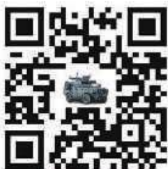
Rhino Guard APC 2+2