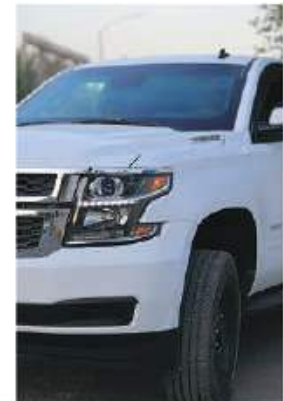
TECHNICAL INFORMATION COMPARISON