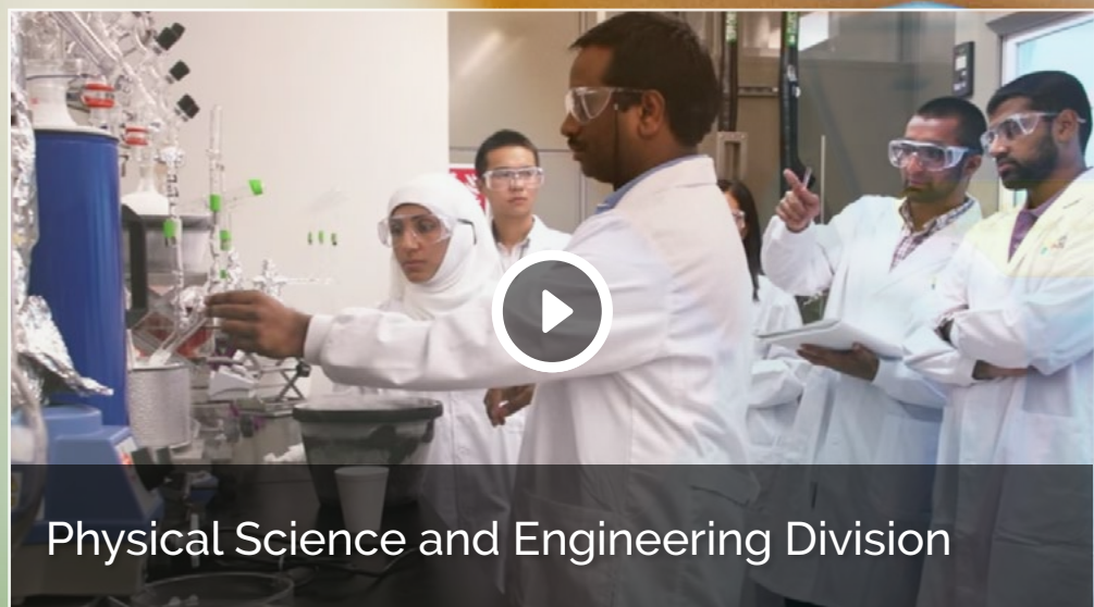
Physical Science and Engineering Division